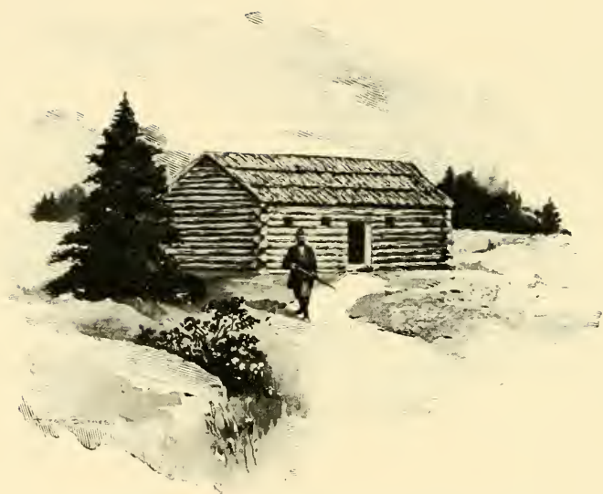
THE LOG MEETING HOUSE, CONCORD, N. H. 1726—1751.