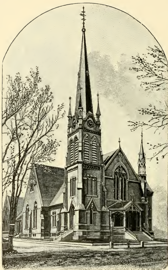
FIRST CONGREGATIONAL CHURCH, CONCORD, N. H. Corner-stone laid July 25, 1874.